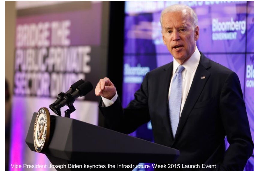
Vice President Joseph Biden keynotes the Infrastructure Week 2015 Launch Event